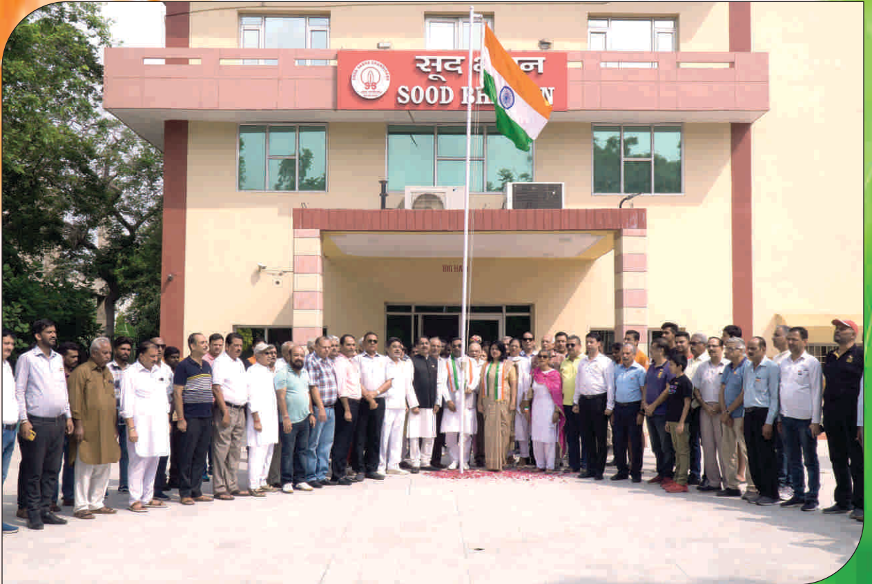
Flag Hoisting on Independence Day at Sood Bhawan, Sector 10, Panchkula.

• Sood Sandesh ₹ 500/- (Membership for ten years)