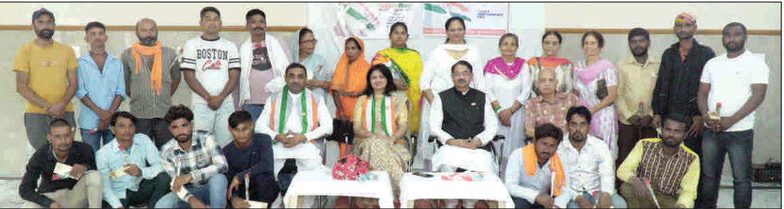
Honoring Rescue Team of Ghaggar Flash Flood Lady incidence.