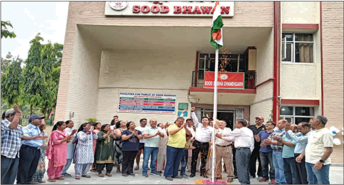
Flag Hoisting on Independence Day at Sood Bhawan, Sector 44A, Chandigarh.